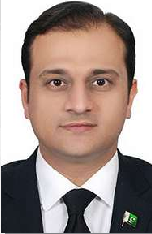
BARRISTER MURTAZA WAHAB Mayor, KMC & Chairman Governing Body, Karachi Medical & Dental College