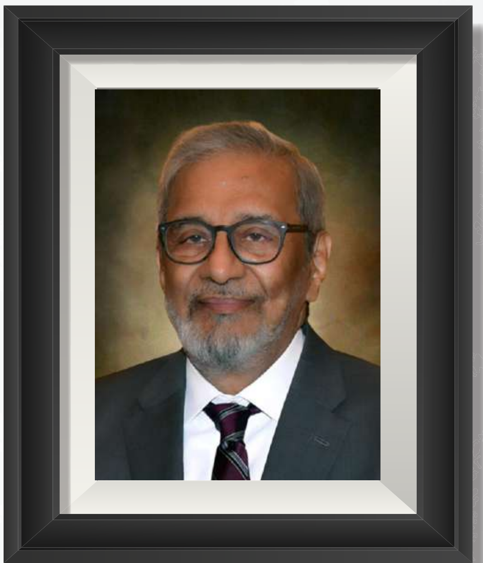
Justice (Rtd.) Maqbool Baqir